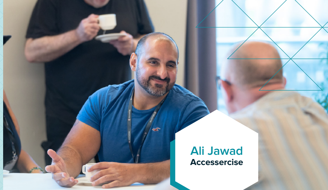
Ali Jawad Accessercise

The first-ever fitness app designed specifically for disabled people. Co-founded by Ali, a Paralympic silver medallist, and Sam, a 3x European sailing champion, Accessercise's USP lies in empowering disabled users to take control of their health through inclusive, impairment-specific content, breaking down barriers to fitness.